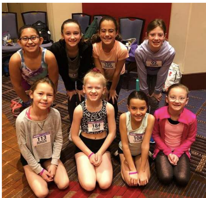
NSDS dancers at the JUMP! convention in Chicago!